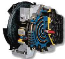
Pic 1 Airend Structure

SCR use a world-renowned scroll airend in the XA range for enhanced reliability. The compression chamber and lubricant system is 100% separated meaning there is no risk of oil contaminated air.